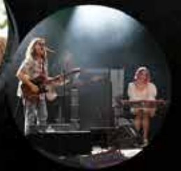
LITTLE MAGIC SAM BAND