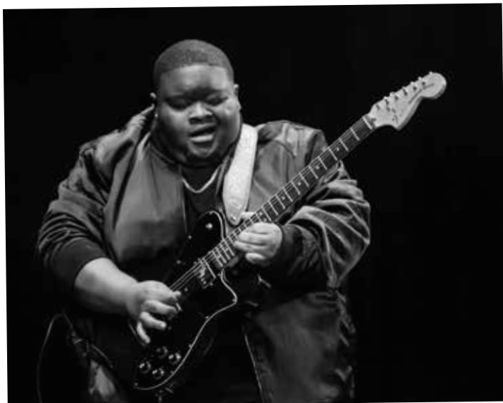
Christone "Kingfish" Ingram has been hailed as the "future of the blues" and he is living up to that rep. See him raise the roof at the Danforth Music Hall, Toronto Saturday, October 4 (7:00 pm)