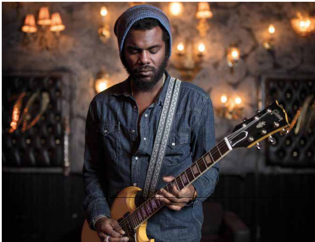
The hottest act on the blues circuit, Gary Clark Jr. plays two shows at History, 1663 Queen St E on Sunday May 26 and Monday May 27