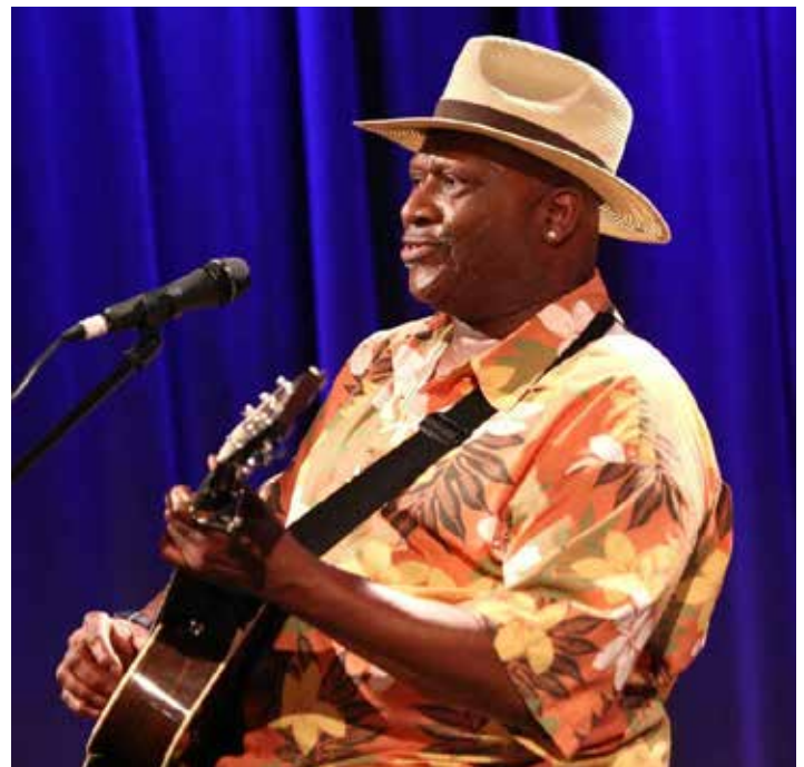
Blues pioneer Taj Mahal joins kora master Sona Jobarteh at RCM Koerner Hall in Toronto on March 9