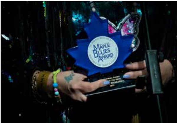
Magic Moments at the MBA and Blues Summit