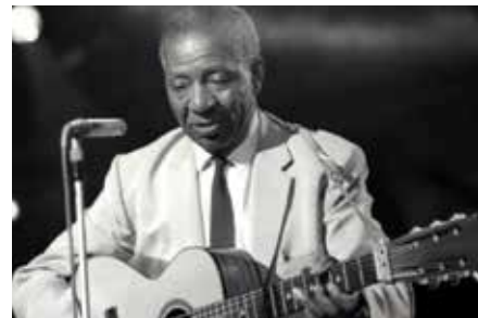
LONNIE JOHNSON 1899-1970