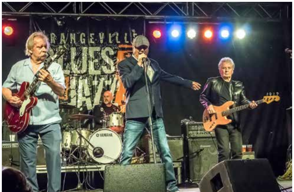
The Downchild Blues Band kicks off 2023 and their 54th year with two sold out shows May 5 & 6 at the Bancroft Village Playhouse before moving to Massey Hall in Toronto on May 13th with special guest Daniel Lanois. Ticket info at http://www.downchild.com

Grand River Blues: The continuing 20th Anniversary Celebrations of The Grand River Blues Society has a show at the Polish Hall in Brantford on Thursday, April 6 th with