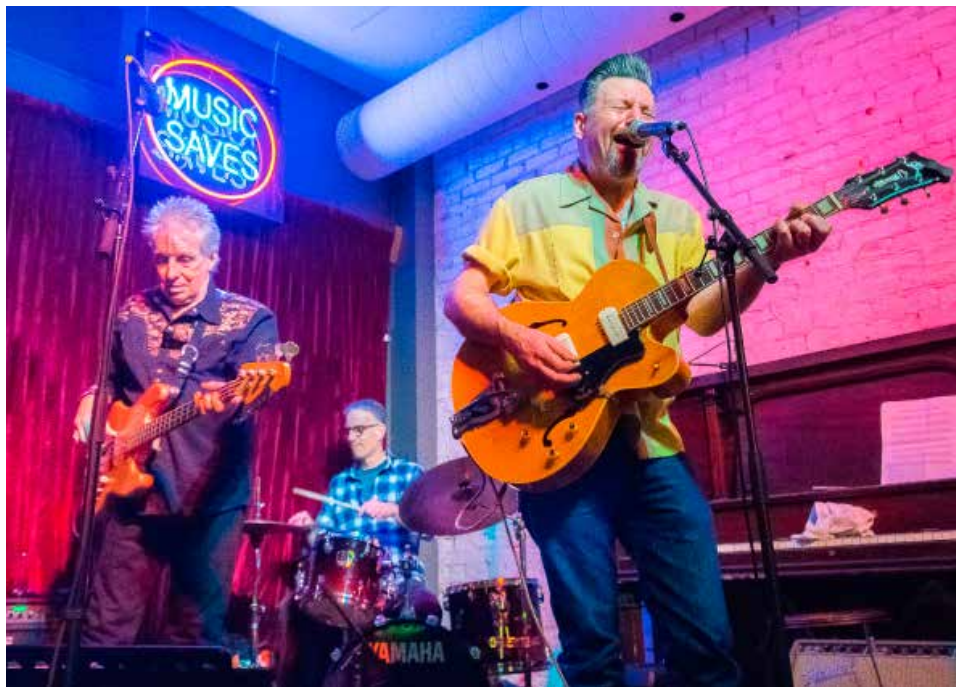
The Swingin' Blackjacks never fail to pack the dance floor with their infectious rockabilly groove and the Redwood dance floor will be bouncing at the TBS Birthday Bash. The Blackjacks hit the stage at 9pm, Sugar Brown plays a set at 8pm and Dance Lessons start at 6:45.

Blues Dancing: Blues Dancing has Afro-American roots, and there are as many interpretations as there is music. It grew from African dances, including the Black Bottom and Cakewalk, often considered 'derisive' dance forms that mocked white slave owners. Early blues dances were slow and embodied the aesthetic approach to the rhythm, movement and melody that permeated black music. They mainstreamed in the 1920s, but bluesy steps and styles evolved to incorporate swing and jazz dance elements and later adapted to dances like Lindy Hop that are still popular today. Slow Drag, Struttin', Jukin' and Ballroomin' are just a few of the blues dance styles that have travelled through time and that we dance to in response to blues music.