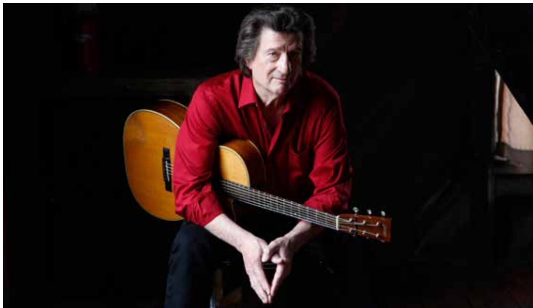
Chris Smither has written songs for a who's who of blues, folk and even jazz icons (Bonnie Raitt, The Dixie Chicks, Emmylou Harris, John Mayall, Diana Krall) but is also a powerful performer in his own right. He's touring in support of his new release, Call Me Lucky, and plays Hugh's Room Live on May 19.