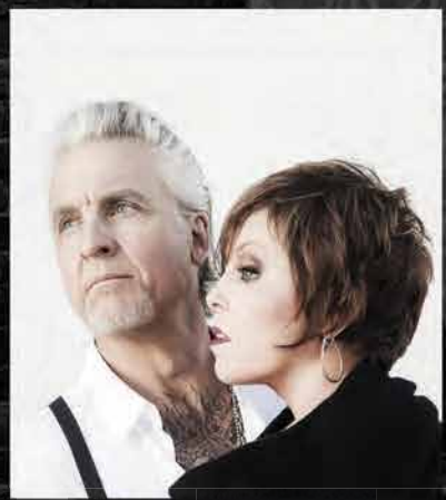
PAT BENATAR & NEIL GIRALDO

PROUDLY PRESENTED BY tbaytel MARINA PARK THUNDER BAY, ONTARIO CANADA