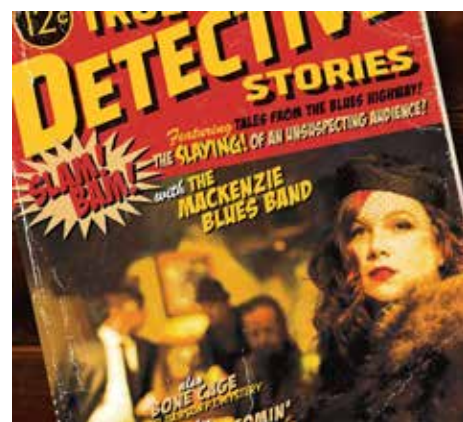
MacKenzie Blues Band Slam! Bam! Oh! Town

created for donations, www.http://ymlp.com/zelw6y , and you can also read more about his history and stay updated. You should also check out those Twisters CDs and now this wonderful solo disc to see what we've lost, hopefully only temporarily. www.davehoerl.com is the new web site.