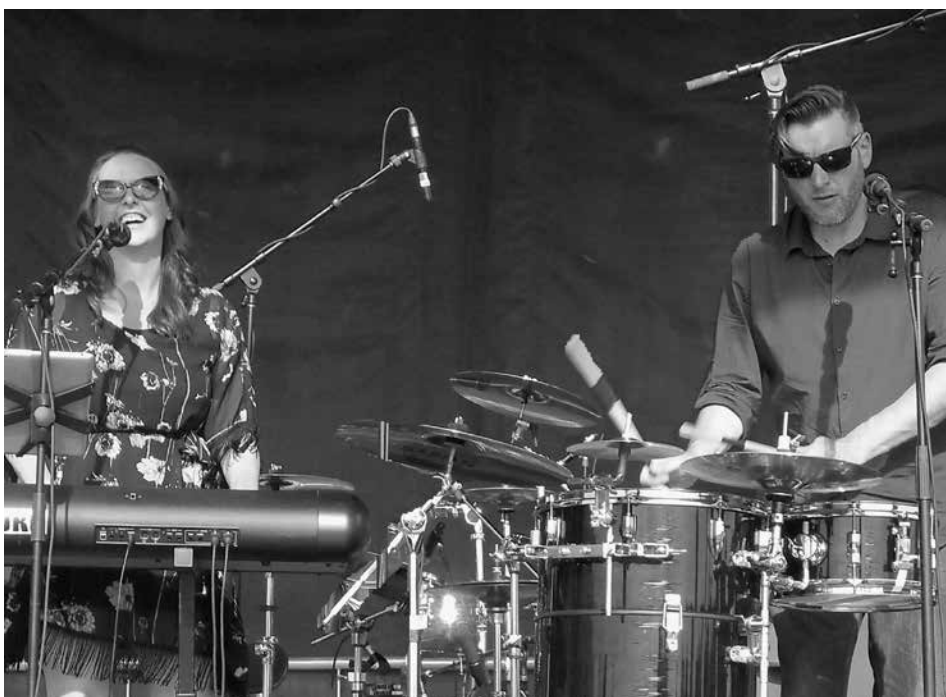
Talent Search finalists the Oh Chays will be performing at the TBS' Blues In The Garden in the Artscape Garden at 910 Queen St. W on Sunday, September 14.