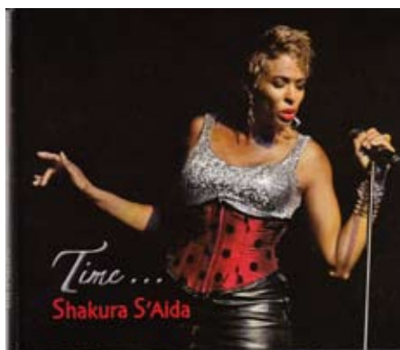
Shakura S'Aida Time Electro-Fi/Outside