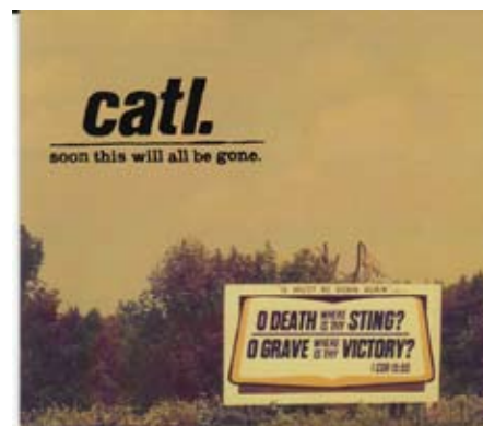
Catl Soon This Will All Be Gone (Weewerk)